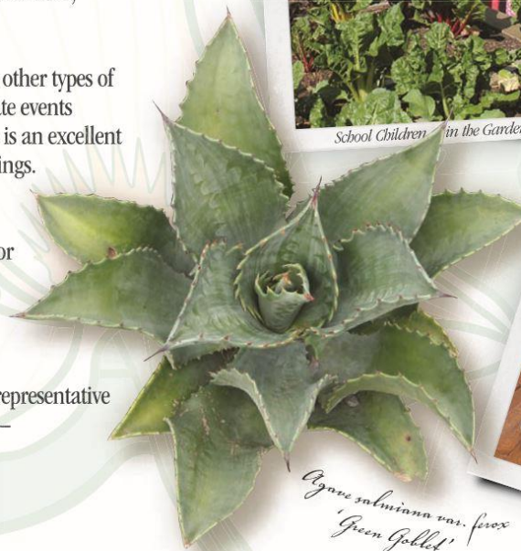
Aloe salicaria var. ferox 'Green Gullet'

For more information, speak to a representative of the garden, or visit our website — www.cienerbotanicalgarden.org .