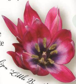
Tulipa 'Little Beauty'

Currently there are over 1500 plant species in the garden, while thousands more are grown off site for future spaces and plant sales.