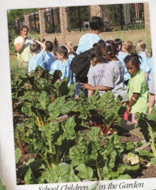
School Children in the Garden

Our Garden Staff and other professionals regularly share their knowledge and expertise through lectures, classes and workshops on gardening, painting, photography, floral design, wreath making, garden art and more. We also offer guided tours and a number of educational school and youth programs.