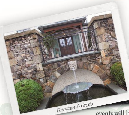
Fountain & Grotto